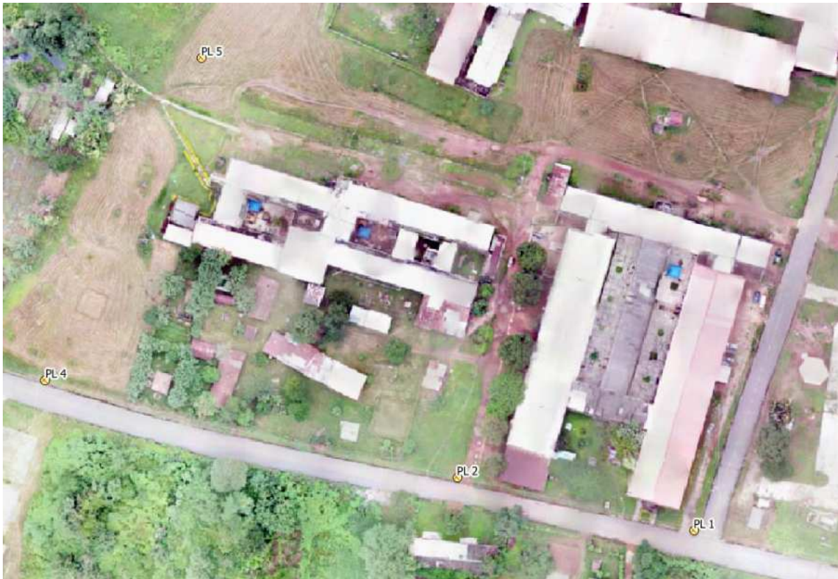
Figure 2.0 Sample Orthophoto showing comparison points for the Old School of Engineering Area