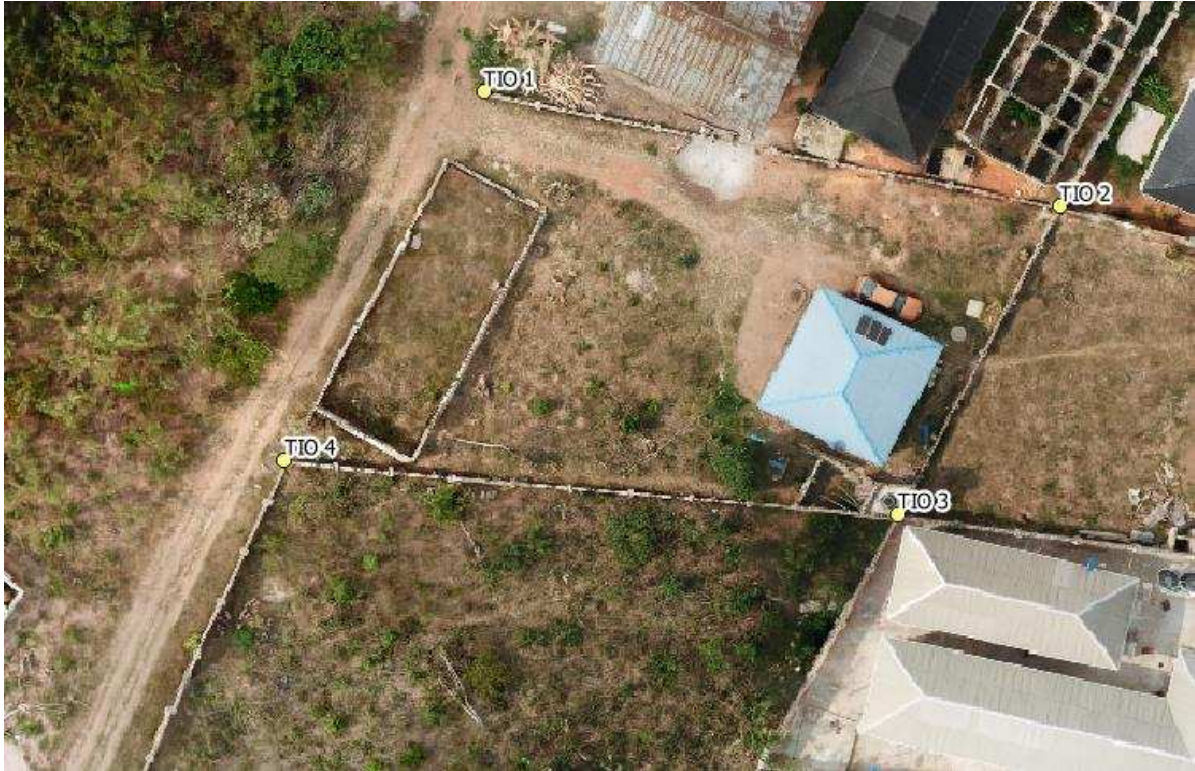
Figure 3.0: Sample Orthophoto Showing comparison points for Toluwani Bakery