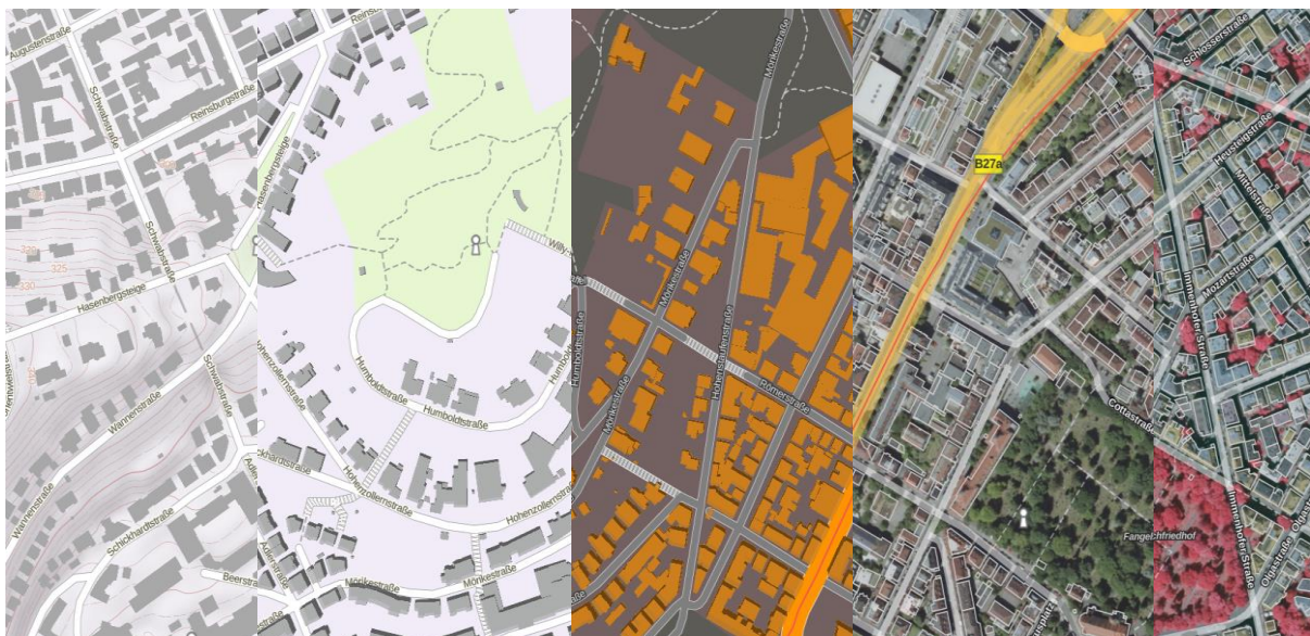
Fig. 2: Different standard styles of the web map (from left to right): relief, standard, night design, aerial photo, infrared

Compared to the previous raster web maps of the AdV (e.g. WebAtlasDE), the new vector tiles map contains also LoD1 buildings, contour lines and hillshade representation, each of course covers the entire national territory. A self-developed application (Map Editor) also provides different representations (styles) (see Fig. 2). With an editing function, any elements can be selected and highlighted, as well as any cutouts can be integrated into your own web applications as an IFrame.