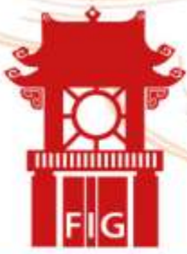
FIG WORKING WEEK 2019