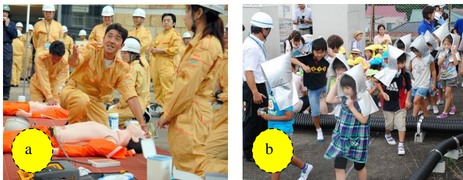
Figure 1 Activities of children of primary school and secondary school

Japan is one of countries that have a high intensity of the earthquake. Japan has the geological conditions are almost the same as Indonesia, is located on the two plates meeting the world is meeting the Pacific plate and the plates Sirkum Sirkum Mediterranean. This causes the vulnerability of Japan to the earthquake. In coping with disaster, Japan has implemented ways to minimize disaster victims through disaster education, especially in primary schools, junior high schools and high schools. Disaster mitigation education has been implemented into the curriculum of disaster. Disaster education has been implemented by the State of Japan according to Nakamura (2007), namely Video for disaster risk education, Instruction based on manuals, lesson and experiment by experts of disaster prevention, Earthquake experience by utilizing special cars, Drill for disaster prevention, Student's activities, First aid in time of disaster.