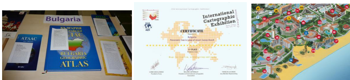
Fig.4. Bulgarian participation and an award in Map Exhibition, Paris, 2011

Cartographic Studio "DavGeo" with a map of Sunny Beach was awarded first prize in the category "Maps for tourism, orienteering and parks" in the International Cartographic Exhibition at the 25th International Cartographic Conference in Paris, France (see Fig. 4).