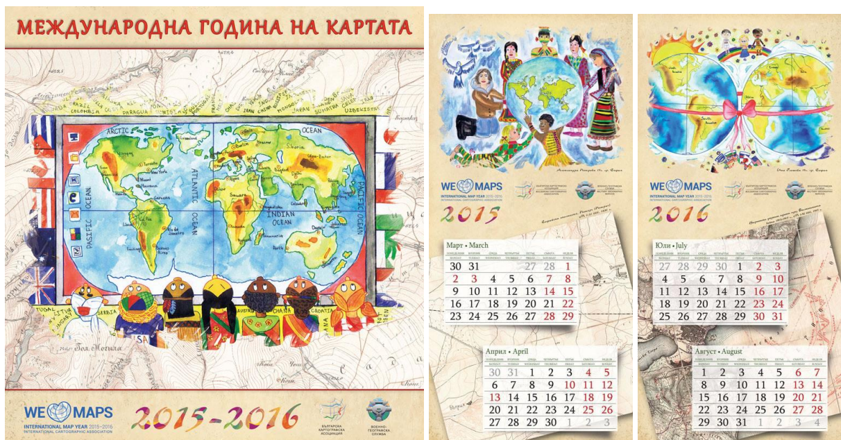
Fig.8. Bulgarian Calendar published by BCA and MGS for International Map Year 2015-2016