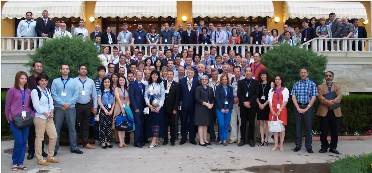
Fig.3. Group photo of participants at 5th International Conference on Cartography and GIS, Riviera, Varna, Bulgaria

mentioned Seminar that has acquired EU dimension built around the Bulgarian and Czech combined efforts. Among the members of the Local Organizing Committee, numerous universities that specialize in the field of Cartography and GIS can be distinguished. The organizers are proud to announce that the following leader companies in geoinformatics and cartography domains participate as sponsors of the event: ESRI, KB Panorama, Intergraph, Bulgarian Geoinformation Company, Chamber of Graduated Surveyors, DataMap-Europe.