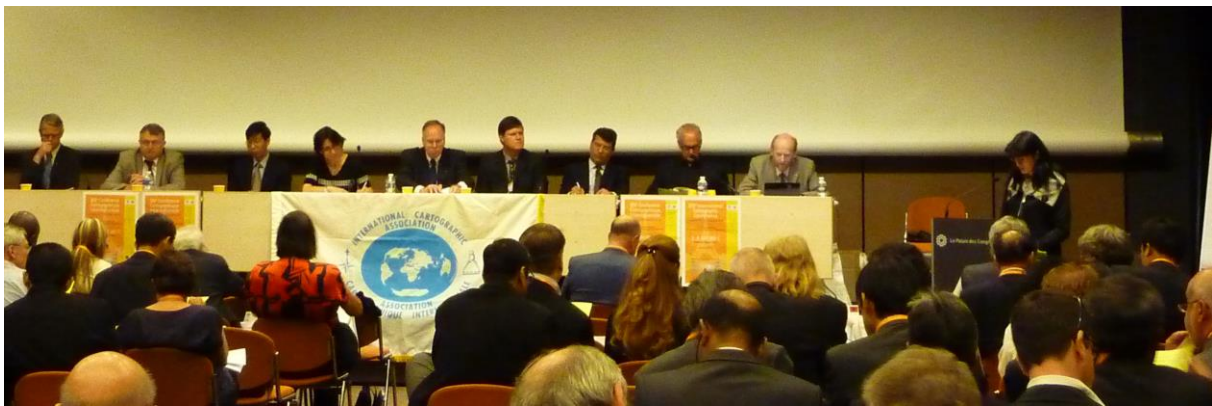
Fig.1. BCA becomes a national member in ICA, Paris, 2011

Eighty national members from all over the world are members of International Cartographic Association (ICA), www.icaci.org . The members are usually the cartographic societies, established as bodies in every country. Several countries have not independent cartographic societies. Cartographers are a part of societies including geodesists, photogrammetrists, surveyors and other closely oriented specialists. The situation was similar in former socialistic countries but after 1989 many of them established their own cartographic societies. The same fact happened in Bulgaria. Bulgarian Cartographic Association (BCA) was chosen for national representative of Bulgaria in the International Cartographic Association in Paris, July 2011 and replaced the Union on Surveyors and Land Managers in Bulgaria (Fig.1).