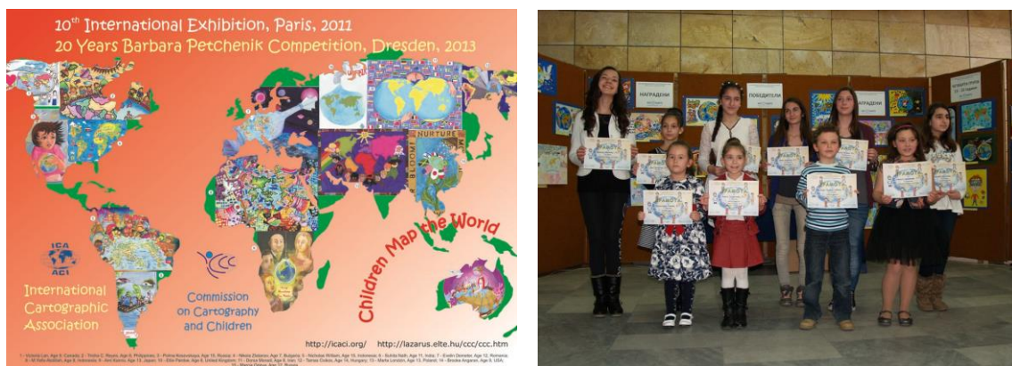
Fig.7. Poster and awarded children, participated in Barbara Petchenic Competition, 2015