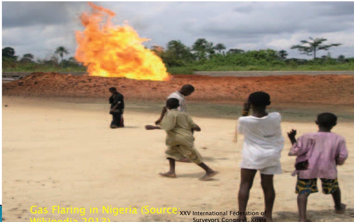
Gas Flaring in Nigeria

XXV International Federation of Surveyors Congress, Kuala Lumpur, Malaysia, 16 - 21 June 2014