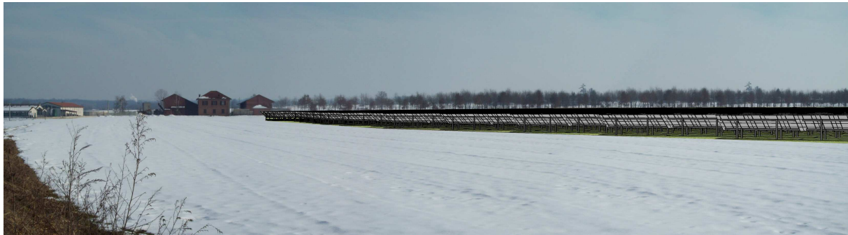
Figure 3. Visual simulation of a ground-mounted PV installation

In the case of sun-tracking systems, the landscape impact becomes greater. This is due to the fact that the sun-tracking system has a greater high above the ground and may easily be seen from the surroundings, and its position changes during the day to follow the sun position. Also the studies to assess the risk of glare from the reflection of the direct sunlight by means of the clear glass PV panel cover are not commonly developed. They are conducted only in cases where the PV plant is near an infrastructure (highway road, airport) or in steep and hilly territories. A methodology to assess the glare risk can be found on (Chiabrande et al., 2009).