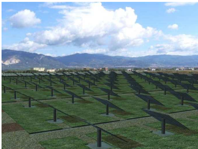
Figure 4. Visual simulation of a sun-tracking PV installation

The short analysis of the documents that are currently produced during the authorization procedure of a PV plant that was presented before, showed that some visual simulation of the landscape integration of a PV plant is always done. These images are requested by the competent Landscape Authority but there is no uniformity on the way in which these images should be evaluated. This is particularly important in case of proximity to historic sites, protected areas, hilly territory or mountains, where the site of the PV plant can be seen from various different locations and may affect the landscape perception from some of the typical views.