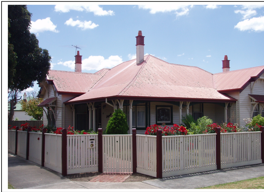
Figure 2 Building no. 3: heritage building with a Star Rating of 2.3

Building numbers 6 and 7 perform reasonably well with 3.6 and 3.4 Stars respectively. These buildings have similar construction (brick veneer external walls, and tiled roof) with insulation to the external walls and roof space only. Building number 6 is located in the climatically colder area of Ballarat (inland location in regional Victoria) than Building number 7 (Melbourne inner north west), which could explain the reason for a much higher heating load and lower cooling load requirement for the building to maintain acceptable internal comfort for the users.