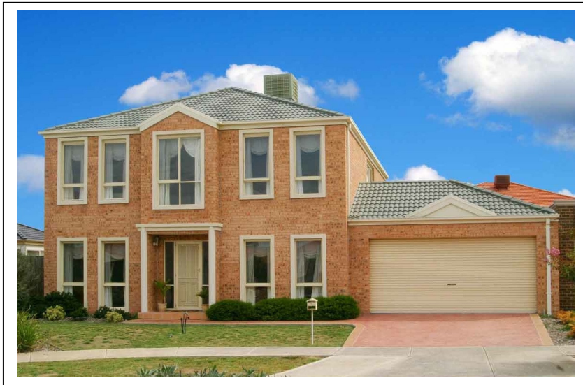
Figure 1 The benchmark. Building no. 1: a modern 5 Star rated house.

The reference building (Building no. 1) dates from 2000, and meets the Victorian government's requirement for a minimum 5 Stars for any new residential building. This modern 2-storey brick veneer building has minimum insulation requirements in accordance with the Building Code Australia (BCA). Insulation is provided within the external and internal walls, and the roof in order to meet the minimum Star Rating requirement. There is no external shading to the windows except for the standard blinds installed to the inside face of the windows. A standard eaves (depth 600mm) exists around the building. An image of the building is shown in Figure 1.