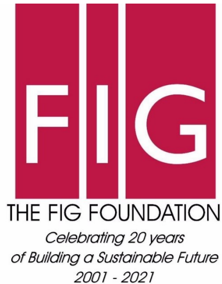
FIG Foundation Board of Directors 2021