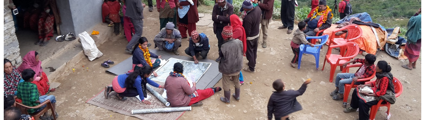
FIG Commission Activities