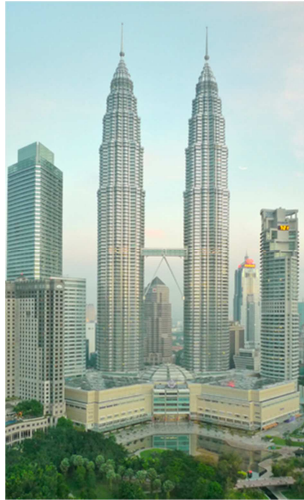
The impressive Petronas Twin Towers in Kuala Lumpur, Malaysia.

Do not miss FIG Congress 2014 which will be a most spectacular event. At the General Assembly there will be voting for the new President of FIG, two new Vice Presidents, the venues both for the 2017 Working Week and 2018 Congress. The Congress will also offer an interesting four-day technical program including plenary sessions, special forums and seminars as well as technical sessions. The call for paper and opening of the submission of abstracts will follow soon. There will be the possibility to submit papers for peer review.