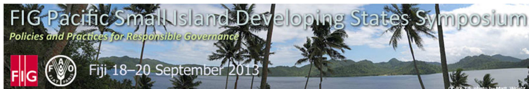
FIG Pacific Small Island Developing States Symposium – 18-20 September 2013

During the XXIV FIG Congress in Sydney, 2010, a seminar was organized to address the challenges Small Island Developing States are facing in achieving the Millennium Development Goals (MDGs) with a special focus on the South Pacific Region. The Seminar emphasized the importance of good land governance especially in relation to climate change and natural disaster; access to land, coastal and marine resources; and secure land tenure and administration. The seminar adopted the "Sydney Agenda for Action" that aims at developing the capacity of land professionals to deal with these challenges.