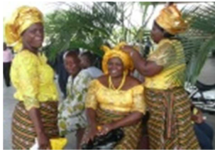
Colourful Nigerian Surveyors Wives

May 2013: www.fig.net/admin/ga/2013/minutes.htm