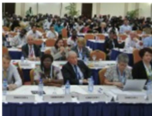
The General Assembly was attended by many delegates and observers.

FIG General Assembly 2013 was held during the Working Week in Abuja, Nigeria. In total 40 different member associations were present at the two sessions of the General Assembly. All membership categories apart from Correspondents were represented, and there was a strong presence of observers, especially Nigerians who followed the General Assembly with great interest.