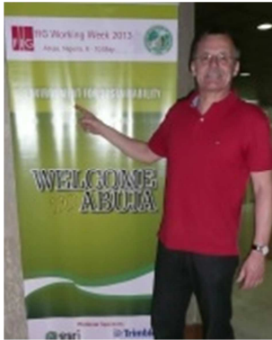
FIG 36th General Assembly 2013 welcomed two New Member Associations 6 and 10 May 2013, Abuja, Nigeria – report and minutes

www.fig.net/admin/ga/2013/minutes/app_26_ga_summary.pdf