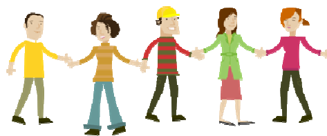
Figure: 2 'Fun' Media Clip Characters

It was decided that a minimal palette of colours should be used with most background elements being illustrated in blues from the DIT branding palette and key elements including characters to be shown in bold colours.