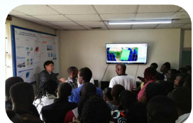
China & Kenya satellite application