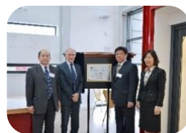
China & UK