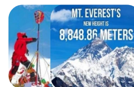
China & Nepal Everest