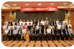
Indonesia satellite application