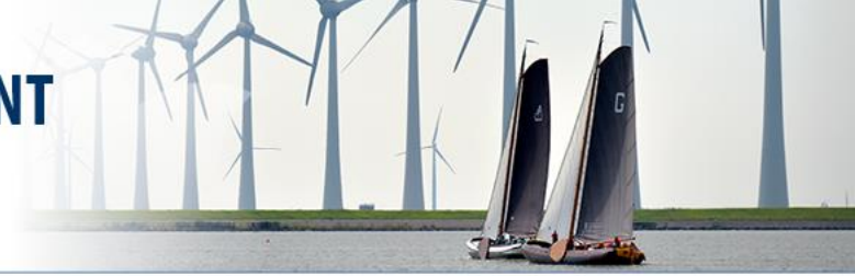
FIG Foundation 20th anniversary (2001-2021)