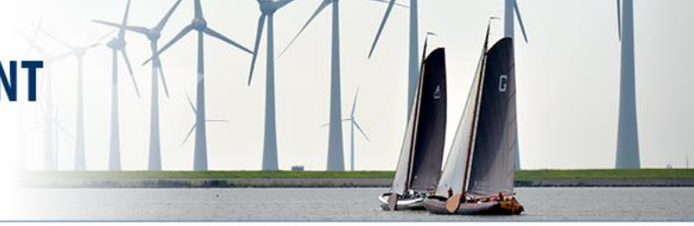
FIG Foundation Grants Awarded 2002 - 2021