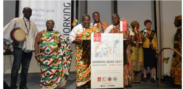
Ghana Delegation on Winning the 2021 Working Week