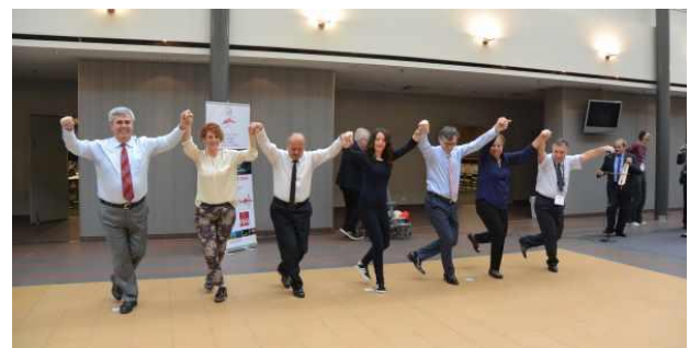
The Turkish Delegation encouraging Delegates to attend the 2018 Congress

It was a good Working Week for Commission 1 with good attendances at the Commission's sessions. Reports from the progress of the Working Groups follow below.