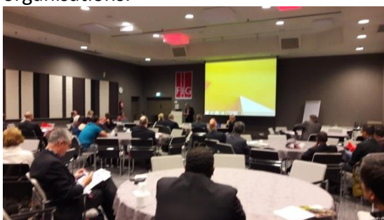
One of the Mutual Recognition Sessions.

The WG 1.5 on Mutual Recognition hosted two sessions during the Working Week, providing attendees with an overview of mutual recognition efforts around the globe and identifying key issues and concerns of member associations. It was clear that this is an ongoing area of interest, not simply with respect to the mobility of professionals, but with respect to the sharing of information between organisations.